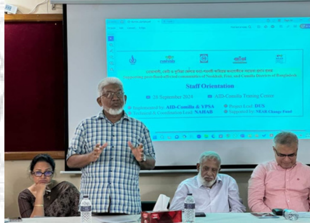
Glimpse of the mentioned speakers